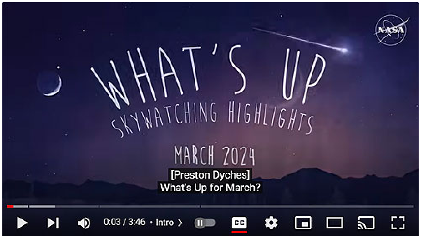
Here's what the night skies have in store. https://www.youtube.com/watch?v=BRIZlw1xw3A