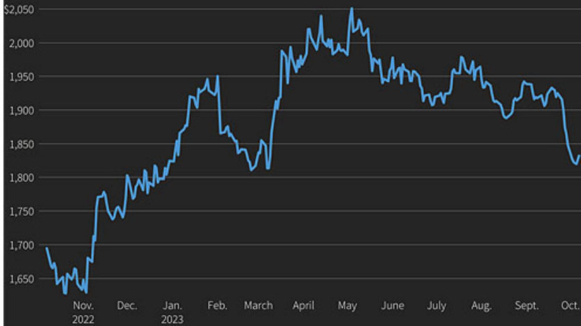
Spot gold price in USD per oz

Published October 6, 2023 at 4:21 PM GMT