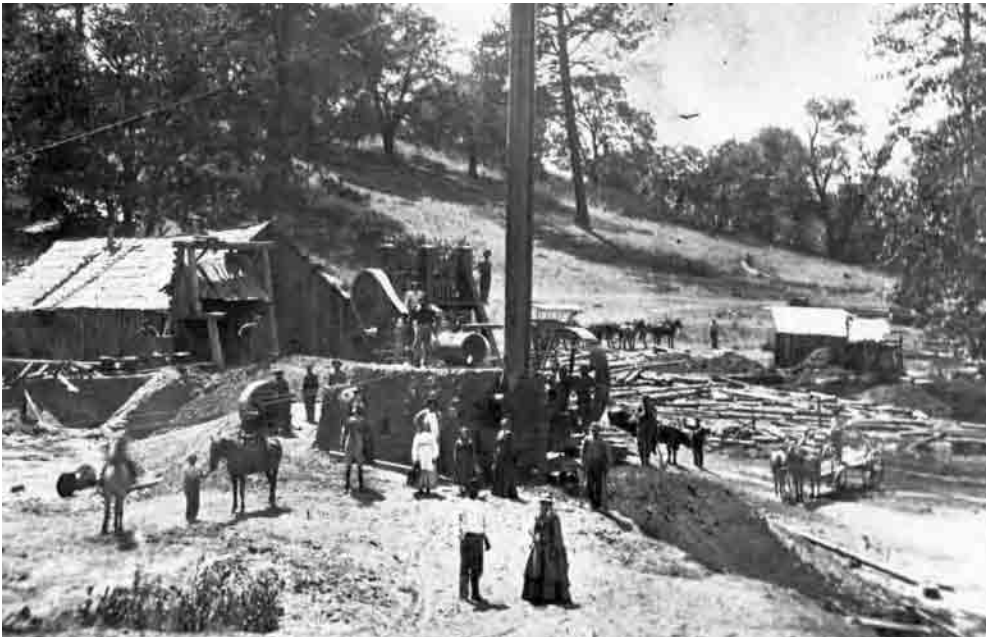
Stereoview of the Stonewall Mine, ca. 1872, before Robert W. Waterman bought it.