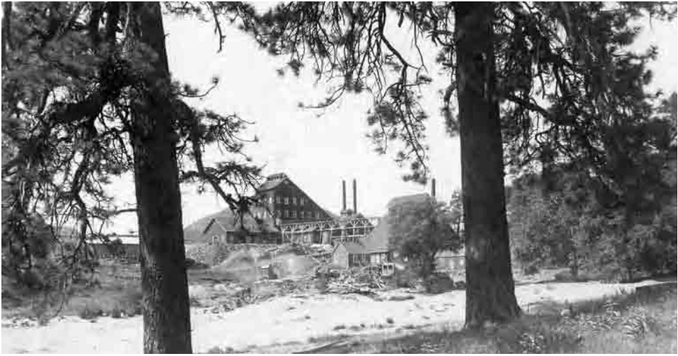
The Stonewall Mine, Rancho Cuyamaca, became the richest gold mine in today's San Diego County.