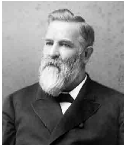
Robert W. Waterman, ca. 1886. Waterman became the seventeenth Governor of California and owner of the Stonewall Mine.

Born in 1826 in Fairfield, New York, Robert Whitney Waterman moved as a child with his family to Newbury, Illinois. He worked as a store clerk and postmaster in Geneva until 1850 when he decided to trek overland to California. He mined for gold before opening a store near the Feather and Yuba Rivers. The following year, he returned to Illinois, becoming a prosperous storekeeper and newspaper owner whose enthusiasm for politics led him to join the young Republican Party of Illinois. He and his family returned to California in 1873, established a ranch near San Bernardino, and undertook various business enterprises. The most successful by far was the acquisition and development of seventeen silver mining claims near today's Barstow, formerly known as Waterman Junction. Ownership of the mines rewarded