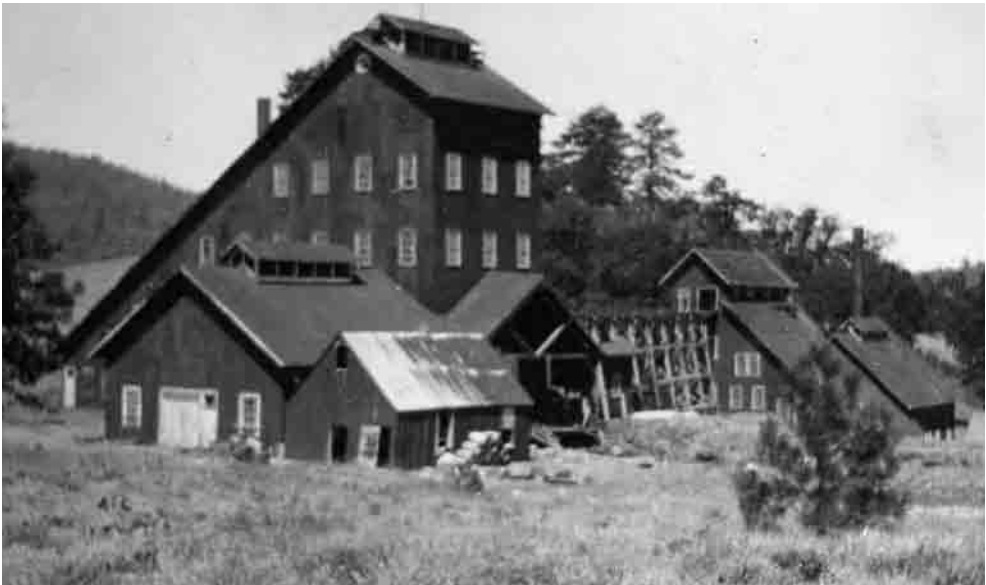
Stonewall Mine, abandoned, ca. 1903.