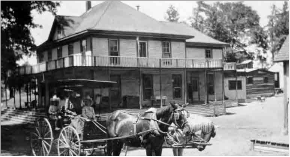
By 1908, the Cuyamaca Hotel had been enlarged to accommodate visiting San Diegans.